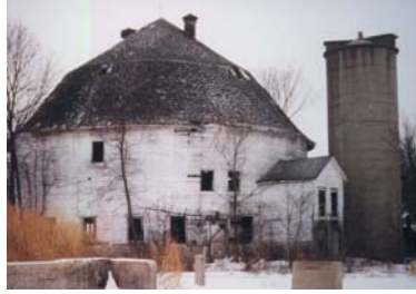
Dougan Round Barn, Beloit, WI