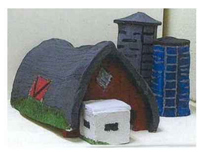
CLAY BARN BY WEST SALEM STUDENT