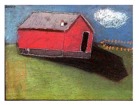
DRAWING BY WEST SALEM MS STUDENT

We started the unit by viewing the Hyperstudio presentation and learning about barn styles and construction. Very early in the unit, we visited two working farms to see a 100 year old barn, still in use, a modern milking parlor installed in an old barn, a stanchion milking operation, a state of the art pig barn and a new "curtain" barn for dairy cows. The students were able to go down in the pit at the milking parlor and also visited with the animals at both farms. We were also able to visit Norskadalen, an outdoor museum with several barns and outbuildings built in the mid-1800s by Norwegian settlers in our area.