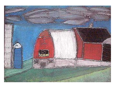
BARN DRAWING BY WEST SALEM STUDENT

pieces as templates for the clay. The clay barns were difficult and required a lot of problem solving on the part of the students to accomplish their ideas. Most students chose to use acrylic paint to decorate their barns. As students finished working with clay, they began a landscape